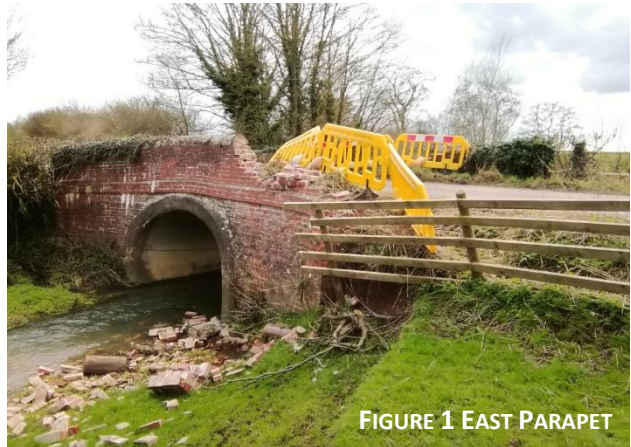
FIGURE 1 EAST PARAPET

Due to the size of these barriers we would not be able to provide sufficient carriageway width to enable the road to open to even cars only.