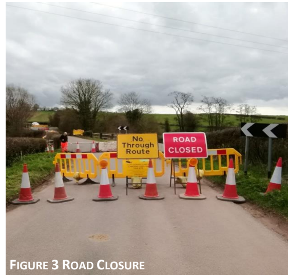
FIGURE 3 ROAD CLOSURE

We will keep all affected parties informed as the scheme progresses.