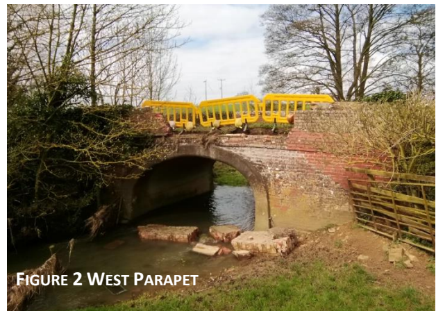
FIGURE 2 WEST PARAPET

As part of the scheme preparation works there are a number of consents / surveys / approvals that are required